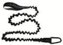
Paddle leash: Connects the paddle to the kayak