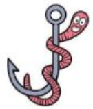
Bait: something that tricks fish to bite the hook